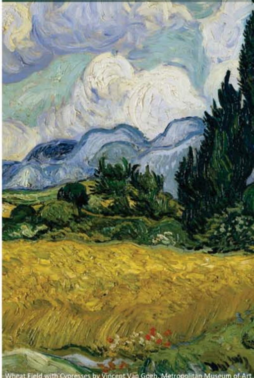
Wheat Field with Cypressess by Vincent Van Gogh, Metropolitan Museum of Art