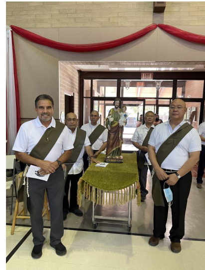
The Legion of St. Joseph