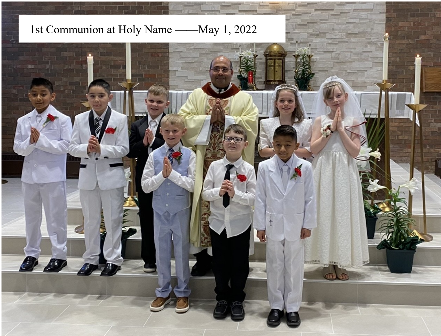
1st Communion at Holy Name —May 1, 2022