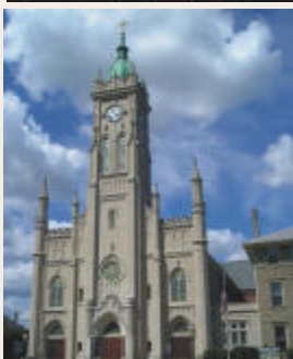
St. Julie Billiart Church

171 Washington Street Hamilton, Ohio 45011 513-863-1424