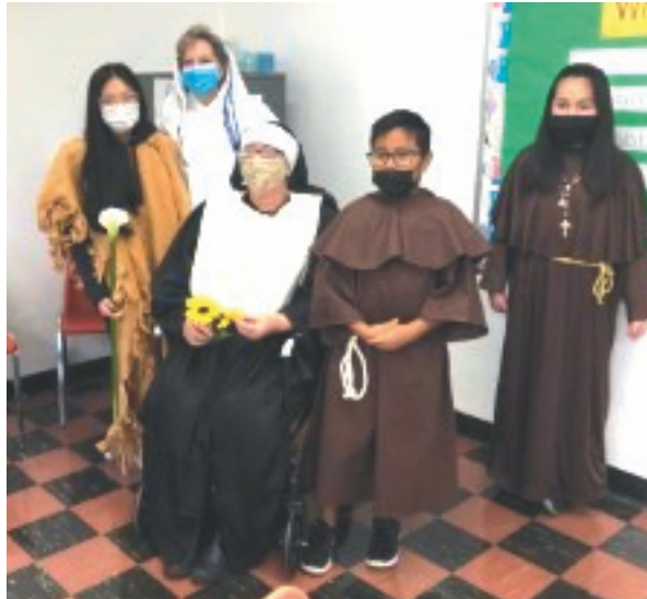
Mother Teresa St. Katerina & St. Julie Billiart