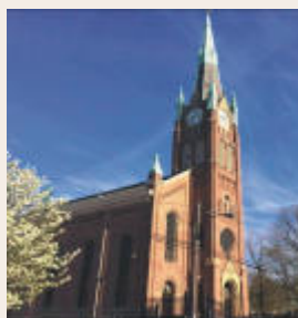
St. Joseph Church

171 Washington Street Hamilton, Ohio 45011 513-863-1424