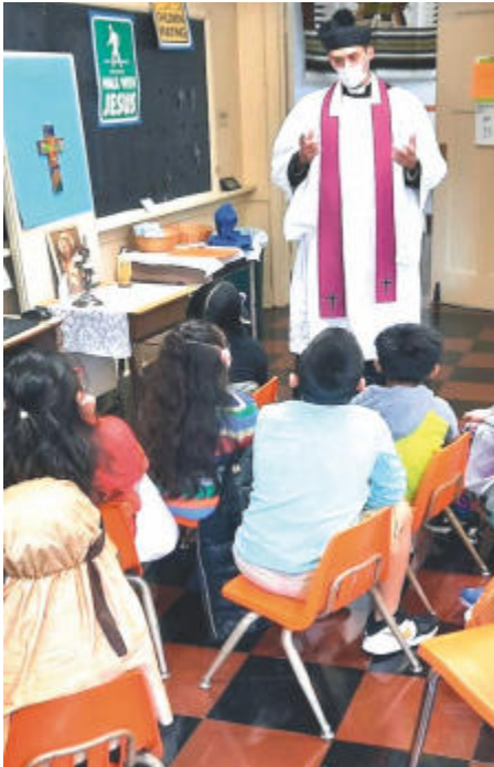
All Saints Day at PREP