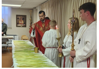
St. Patrick - Tama