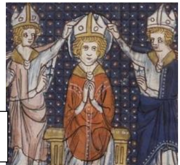
Saint Hilary of Poitiers, Doctor of the Church, Feast day – January 13