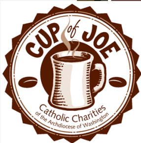
Girl Scouts assembled Cup o' Joe breakfasts in April

assumed the backbone of the project by picking up supplies each month from a Catholic Charities warehouse and making monthly deliveries to the very appreciative shelter residents.