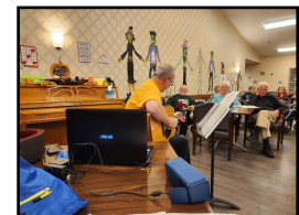
Fire Choir at Park Place