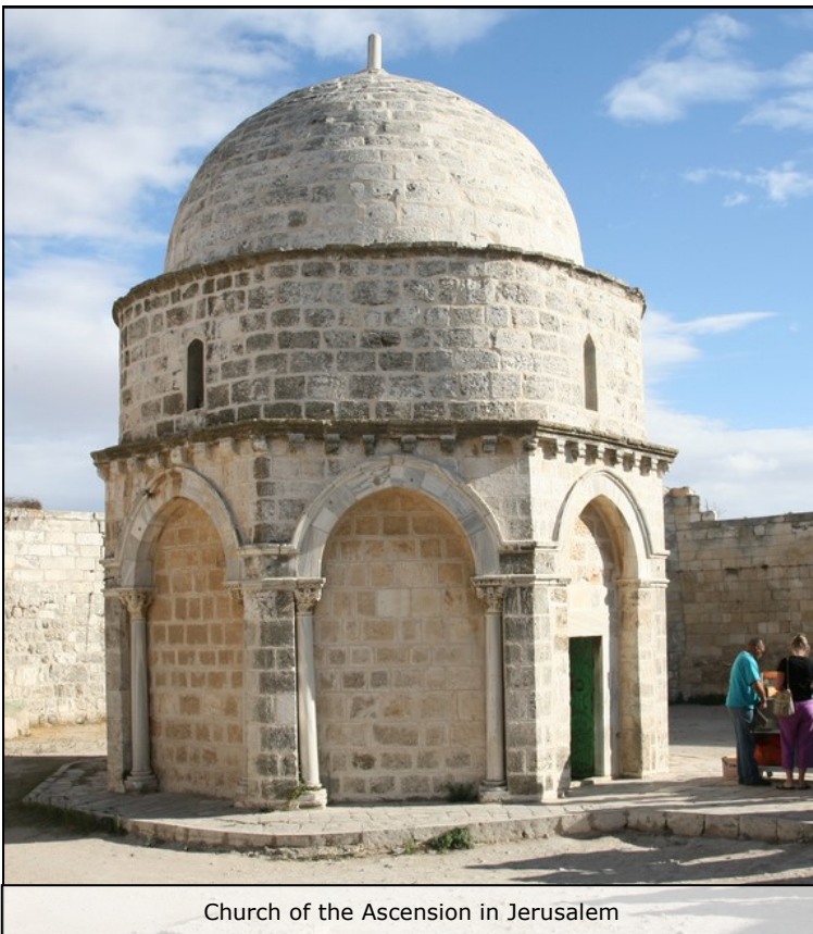
Church of the Ascension in Jerusalem

St. Rita Outreach with Xavier Community Outreach Center 7934 Edinburgh St. NOLA 70125 (504) 324-6630