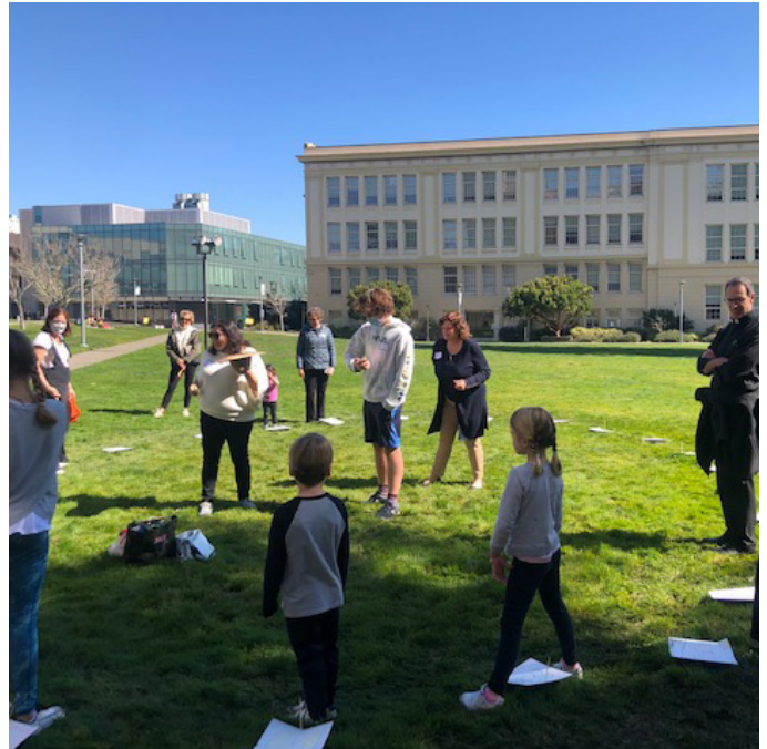
Parishioners enjoying our Midwinter Event: a Mardi Gras Cake Walk sponsored by the Community Commission.