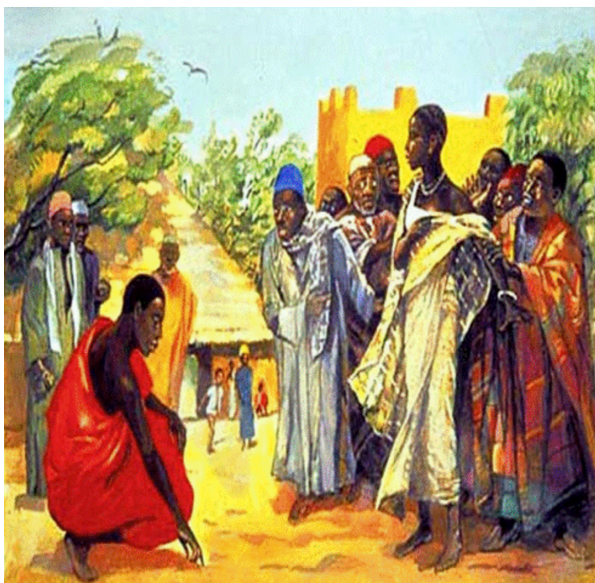
Jesus and the Woman Taken in Adultery