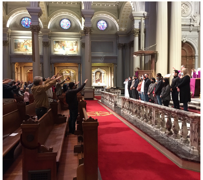
The assembly extends their hands in prayer over the catechumens and candidates as part of the Second Scrutiny.