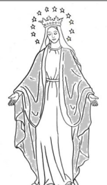
Immaculate Conception Parish, Old Monroe 150th Anniversary

Thank you for your continued generosity and support!