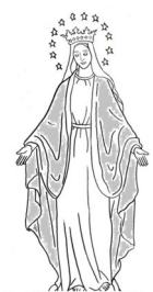
Immaculate Conception Parish, Old Monroe 150th Anniversary

Come join former priests, sisters, and fellow parishioners celebrate this day of worship, blessings, and fellowship along with a display of historical artifacts.