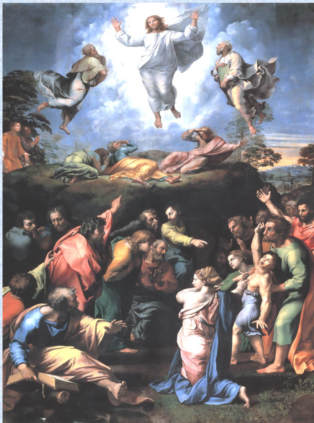
Transfiguration , by Raphael, c.1516–1520, oil on panel Pinacoteca Vaticana, Wikimedia Commons [Public Domain]