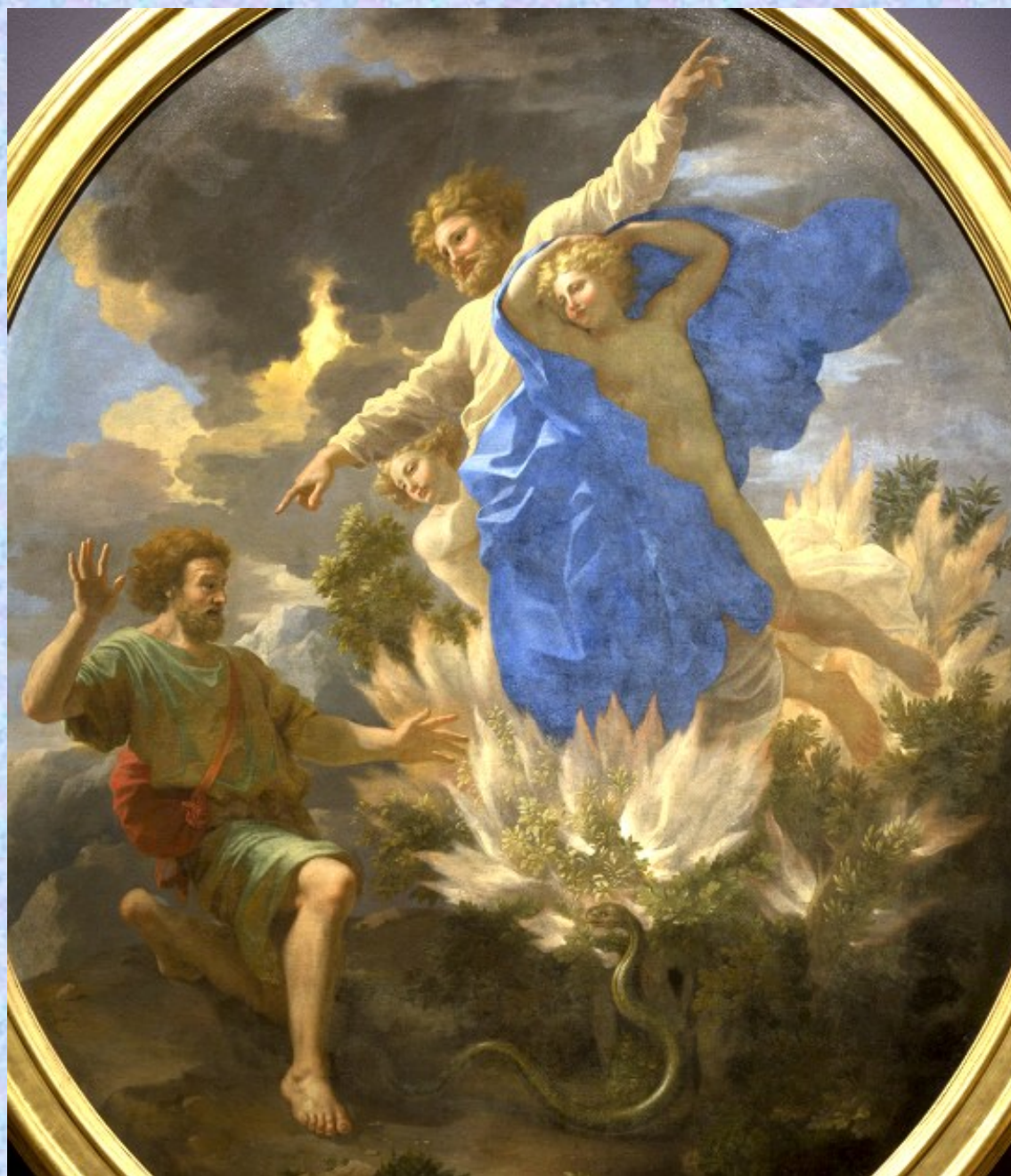
Moses and the Burning Bush , by Nicolas Poussin, c.1641, oil on canvas Statens Museum for Kunst, Wikimedia Commons [Public Domain]