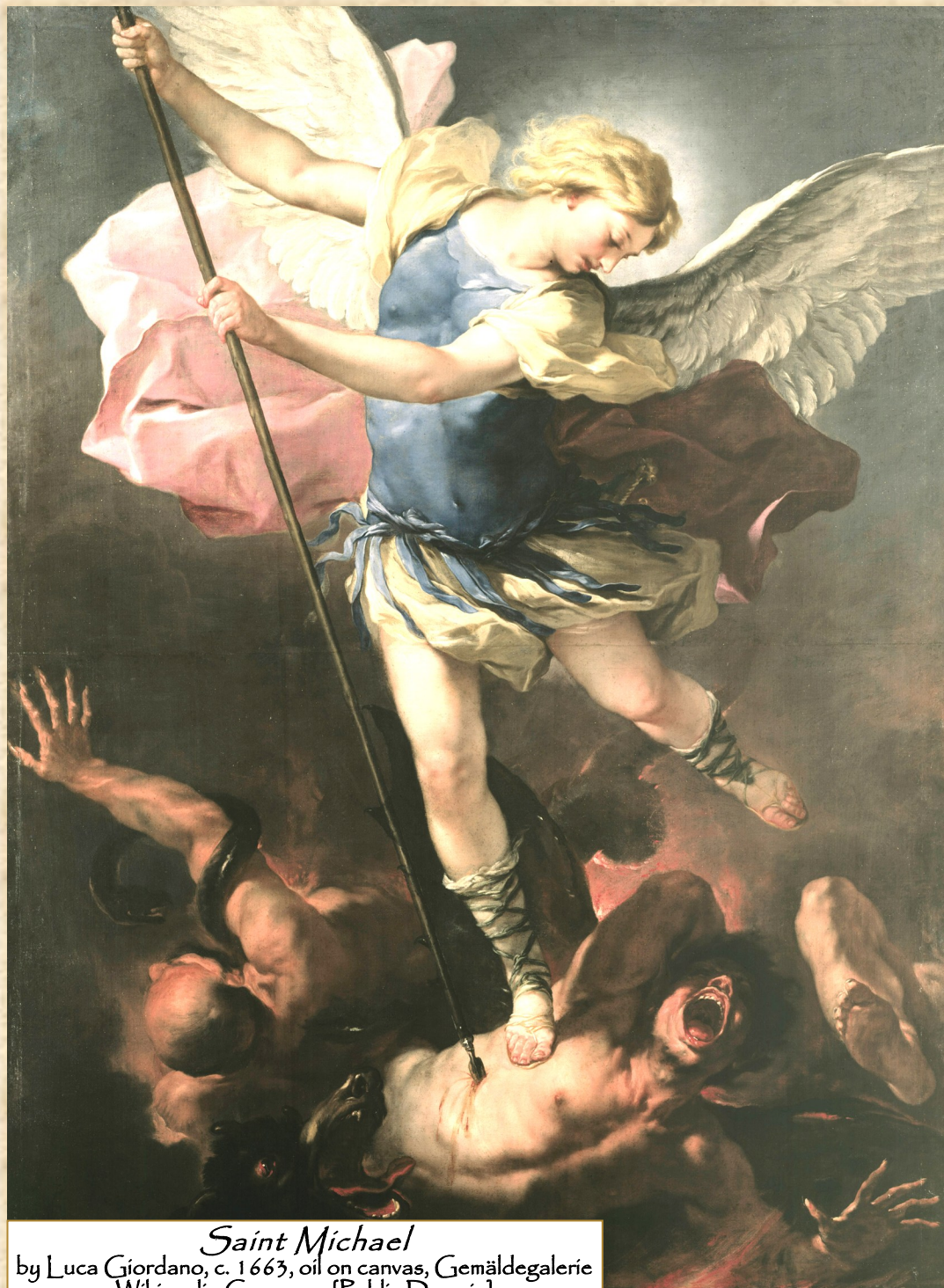
Saint Michael by Luca Giordano, c. 1663, oil on canvas, Gemäldegalerie