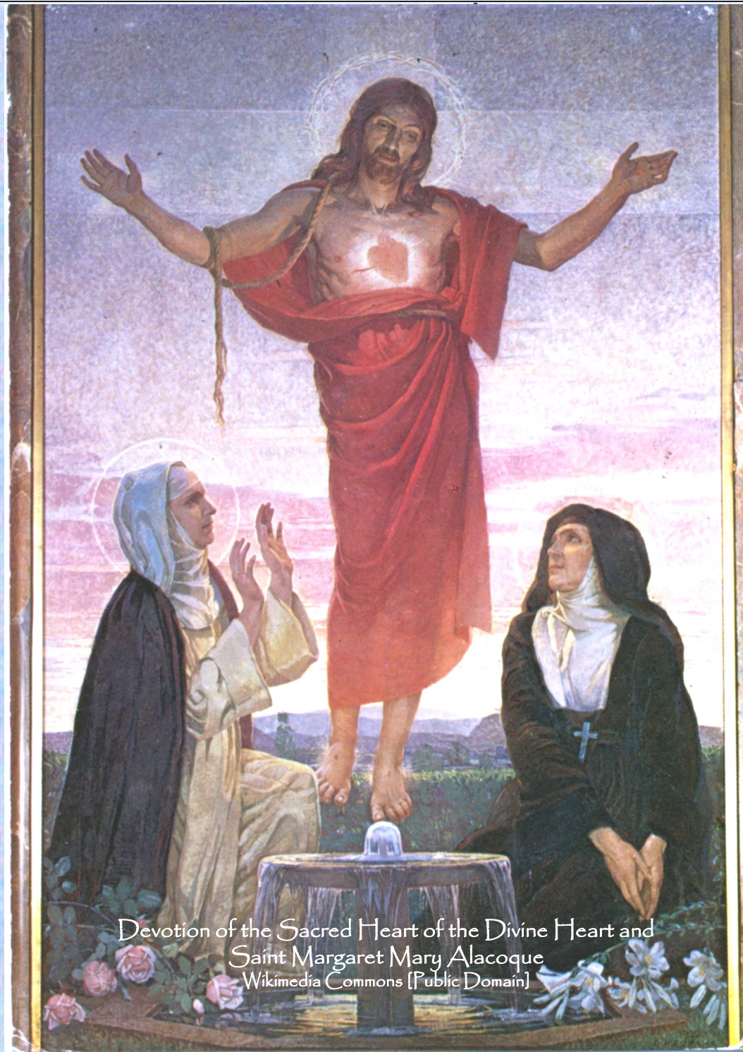
Devotion of the Sacred Heart of the Divine Heart and Saint Margaret Mary Alacoque