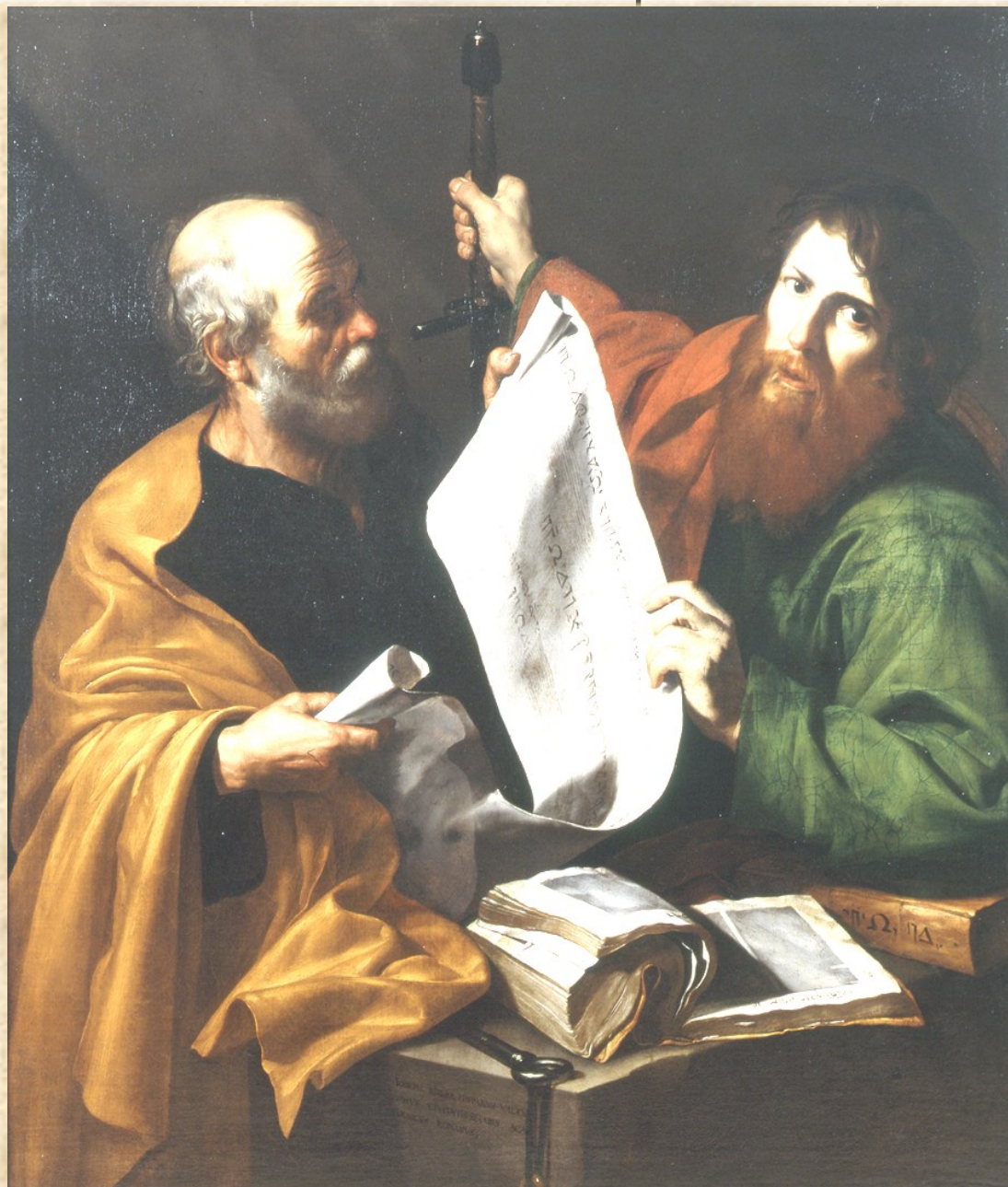
Saint Peter and Saint Paul by Jusepe de Ribera, oil on canvas, c.1616 Musee des Beaux-Arts de Strasbourg