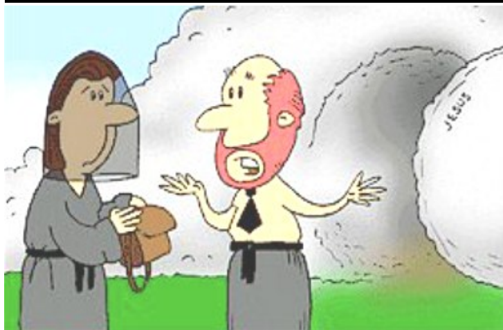
I'm sorry, Ma'am. The resurrection of Jesus was a miracle, not a service of this cemetery.

Do you put God first in all things? Possessions, money, power, ego can easily become gods to many of us. Do a quick check of what is important to you because of your stewardship. Is God at the very top of the list? If not, your priorities need to be re-adjusted. Don't let earthly things become a god before God. This is also the first commandment—I am the Lord your God, you shall not have any strange gods before me.