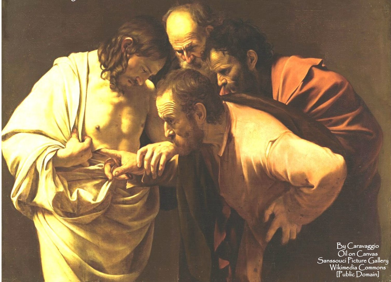
By Caravaggio Oil on Canvas Sanssouci Picture Gallery