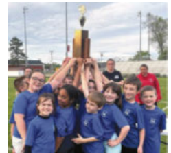
2025 City Champions!