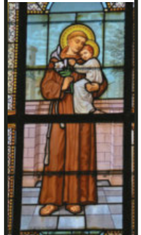
Saint Anthony of Padua, pray for us.