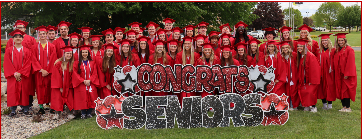
Seniors pose for one last photo together around the Cedar Yard Greeting sign.