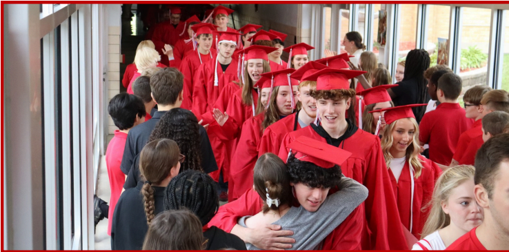
Students of all ages cheer on our seniors during the Grad Walk tradition.

The Class of 2025 celebrated together on May 25. The graduation Mass took place at St. Jude - St. Vincent Site while the Commencement ceremony was held in the Castle Gym. Each handshake and diploma represented years of hard work and dedication. With fond memories and bright futures, the Class of 2025 stepped forward, ready to make their mark on the world.