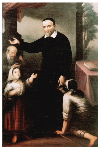
SAINT VINCENT DE PAUL