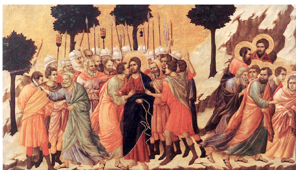
ARREST OF CHRIST by Duccio di Buoninsegna (d. 1319)

The following excerpts are from Pope Francis' Apostolic Exhortation Gaudete et Exsultate (Lt., On the Call to Holiness In Today's World, 19 Mar 2018).