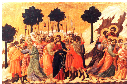
JUDAS BETRAYS JESUS WITH A KISS by Duccio di Buoninsegna (d. 1319)