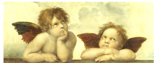
SISTINE MADONNA [detail] by Raphael (d.1520)

The first excerpt below is from Pope Paul VI's 25 July 1968 encyclical HUMANAE VITAE [Lt., Of Human Life]. The Holy Father began by acknowledging "not everyone will easily accept this particular teaching". Indeed. The second excerpt is from the USCCB's (United States Conference of Catholic Bishops) Pro-Life Committee's 1993 statement commemorating the 25th anniversary of the encyclical.