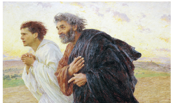
THE DISCIPLES RUNNING TO THE SEPULCHRE by Eugene Burnand (d. 1921)

The first excerpt below is the whole of St John Chrysostom's (d. 407, Archbishop and Patriarch of Constantinople) Paschal Homily . So revered is the homily, majestic and soaring proclamation of Christ's resurrection: Christ has triumphed over evil/death, that it is read aloud each year on Easter Sunday in both Orthodox and Eastern Rite Catholic churches. The second excerpt is from a Holy Saturday (3 Apr 2010) homily of Pope Benedict XVI on the oil of mercy, the medicine of immortality.