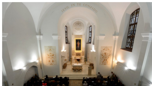
SANCTUARY OF DIVINE MERCY Vilnius, Lithuania

The following are excerpts from Misericors et Miserator [Lt., Merciful and Compassionate ], the formal decree issued May 5, 2000 by the Congregation for Divine Worship and the Discipline of the Sacraments which established the Second Sunday of Easter as "Divine Mercy Sunday".