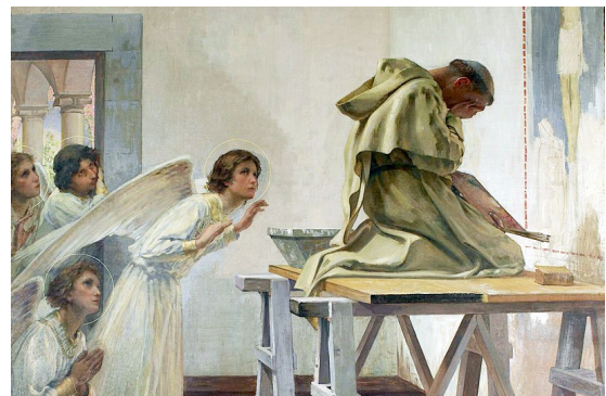
FRA ANGELICO [detail] by Paul Hippolyte Flandrin (d. 1902)

The excerpt below is from the opening paragraphs of Pope Francis' 19 Mar 2018 Apostolic Exhortation, "ON THE CALL TO HOLINESS IN TODAY'S WORLD".