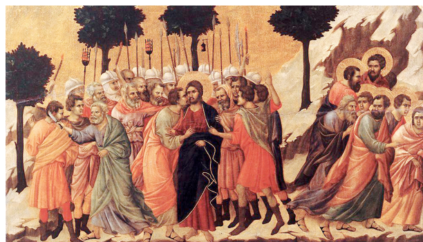
BETRAYAL AND ARREST OF CHRIST by Duccio di Buoninsegna (d. 1319)

The excerpt below is from Pope Francis' 19 Mar 2018 Apostolic Exhortation, "ON THE CALL TO HOLINESS IN TODAY'S WORLD". Beginning at para. 158, the Holy Father says the cross is laid on every Christian. It meets us at the beginning of our communion with Christ. It is that dying of the old man which is the result of his encounter with Christ. In the words of St Rose of Lima (d. 1617), "Apart from the cross there is no other ladder by which we may get to heaven."