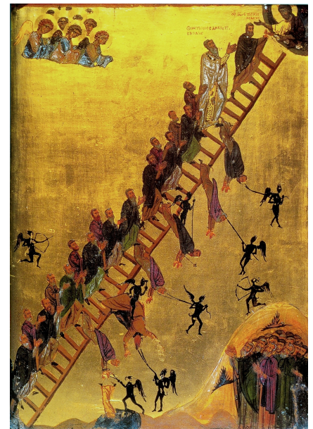
LADDER OF DIVINE ASCENT

The treatise, using the imagery of Jacob's Ladder (see Gen 28:10-19), describes the means by which we overcome our vices and raise our body/soul to God. Each chapter describes a particular virtue, a step/rung of the ladder, that we must strive to acquire by a lively faith. It is our bearing much fruit that glorifies God and secures our salvation: " If you remain in me and I in you, you will bear much fruit; apart from me you can do nothing " (John 15:5).