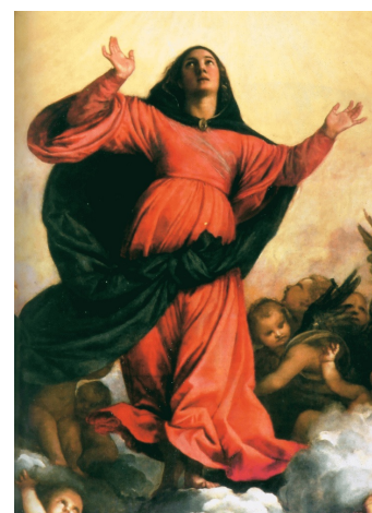
ASSUMPTION OF THE VIRGIN by Tiziano Vecelli (d. 1576)

ON 1 November 1950, Venerable Pope Pius XII proclaimed as Dogma that the Virgin Mary "having completed the course of her earthly life, was assumed body and soul into heavenly glory". This truth of faith was known by Tradition, was affirmed by the Fathers of the Church, and was a particularly important aspect in the veneration of the Mother of Christ. Precisely this devotional element, so to speak, was the driving force behind the formulation of this dogma. The dogma appears as an act of praise and exaltation of the Holy Virgin. It also emerges from the text of the Apostolic Constitution, where it affirms that the dogma is proclaimed for "the honor of her Son ... for the increase of the glory of that same august Mother, and for the joy and exultation of the entire Church". What was already celebrated in the veneration and devotion of the People of God as the highest and most permanent glorification of Mary was thus expressed in the form of a dogma; the act of the