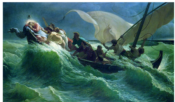
THE WORLD'S THY SHIP AND NOT THY HOME

The first excerpt below is from a homily by St Bernard of Clairvaux (d. 1153). To venerate the memory of the Saints benefits us, not them. The second, from a letter by St Ambrose (d. 397), is a reflection on death.