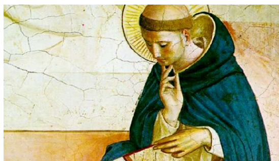
SAINT DOMINIC AT PRAYER [detail] by Blessed Fra Angelico (d. 1455, beatified 1982)

The first excerpt below is from Pope Benedict XVI's General Audience of 8 Aug 2012 on the Memorial of St Dominic. The second is from The Nine Ways of Prayer of St Dominic , a work compiled between 1260-1288 by an unknown Dominican friar with information provided by Blessed Sister Cecilia (d. 13th c., beatified 1891) of the Monastery of St Agnes at Bologna and others who had known the Saint. It recounts St Dominic's eighth way of prayer.