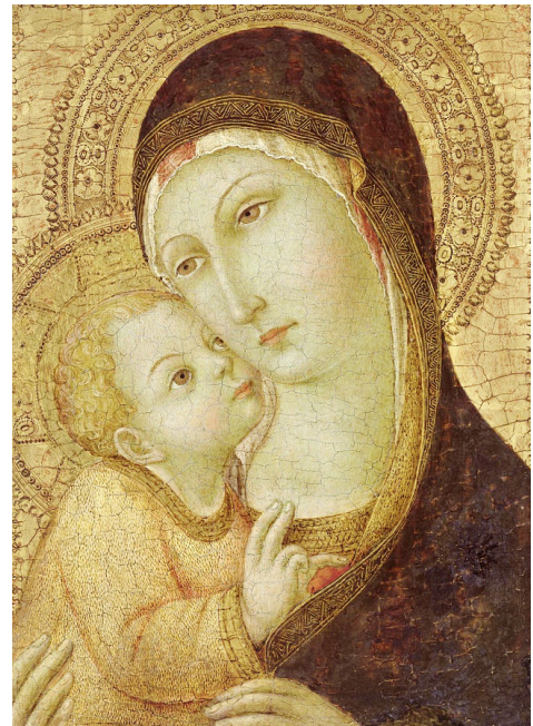
MADONNA AND CHILD by Sano di Pietro (d. 1481)

The excerpt below is from Pope St John Paul II's (d. 2005) 25 March 1987 encyclical On the Blessed Virgin Mary in the Life of the Pilgrim Church [Redemptoris Mater].