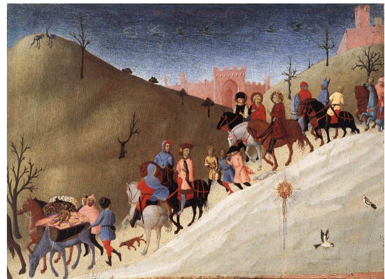
JOURNEY OF THE MAGI by Stefano di Giovanni (d. 1450)

The following is an excerpt from Pope Benedict XVI's homily on the Feast of Epiphany (6 Jan 2006), the first full year of his pontificate. Italics added.