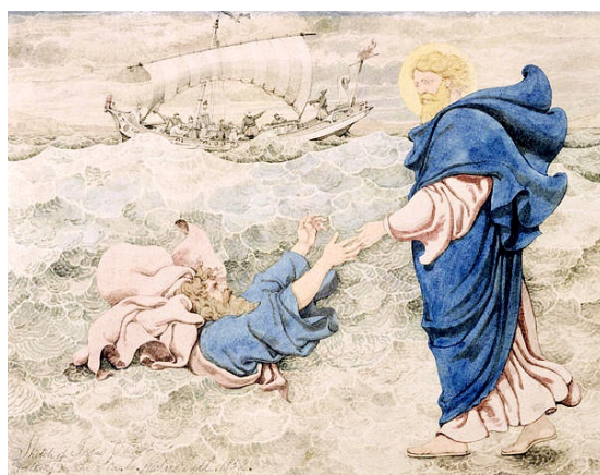
CHRIST WALKING ON THE WATER by Richard Dadd (d. 1886)

The first excerpt below is from a homily by St Basil (d. 379) in which he appeals to the faithful to defend the faith in which they were baptized and by which they received new life in Christ and adoption as children of God: "The common aim of all our adversaries, and of all who are contrary to sound doctrine (1 Tim 1:10), is to overthrow the foundations of the faith of Christ, by leveling the Apostolic traditions to the earth, wholly destroying them." The second excerpt is from a homily by St John Chrysostom (d. 407). He assures the faithful that God's grace is sufficient to overcome all the obstacles that oppose our salvation ... provided we remain "his people, the sheep of his flock" (Ps 95:7).