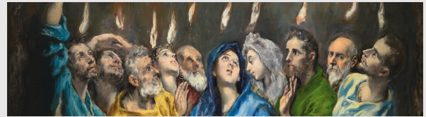
THE PENTECOST [detail] by El Greco (d. 1614)

The excerpt below is from the Little Catechism of the Curé of Ars (St John Vianney, d. 1859), Chapter 3: On the Holy Spirit.