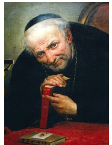
Portraits of SAINT ALPHONSUS LIGUORI, C.S.S.R. as Priest and as Bishop