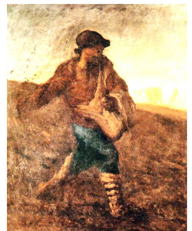
PARABLE OF THE SOWER by Jean Francois Millet (d. 1875)

Be you changed while you may: turn up with the plow the hard ground, cast the stones out of the field, pluck up the thorns out of it. Be loathe to retain that hard heart, from which the word of God may quickly pass away and be lost. Be loathe to have that lightness of soil, where the root of charity can take no deep hold. Be loathe to choke the good seed which is sown in you by my labors, with the lusts and the cares of this world. For it is the Lord who sows; and we are only His laborers. But be you the "good ground. —St Augustine (d. 430)