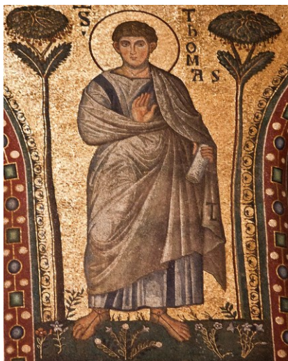
Saint Thomas “My Lord and My God”

Isaiah 66.10-14, Galatians 6.14-18, Luke 10.1-12, 17-20