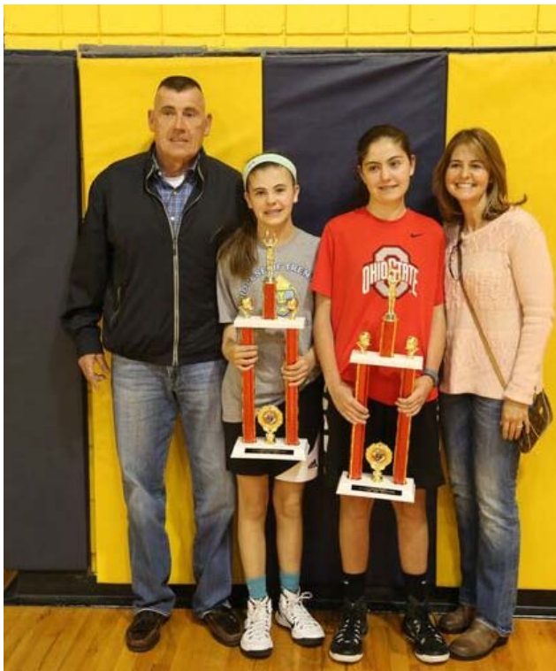
The winners with their respective awards