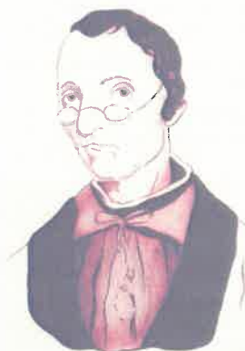
Fr. Gabriel Richard Guild

The Basilica of Ste. Anne de Detroit and the Fr. Gabriel Richard Guild present