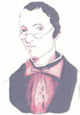
Fr. Gabriel Richard Guild

The Basilica of Ste. Anne de Detroit and the Fr. Gabriel Richard Guild present