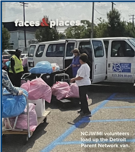
NCJWMI volunteers load up the Detroit Parent Network van.