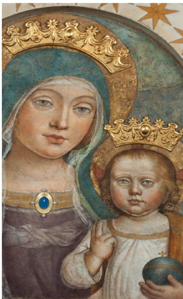
The ancient fresco of Madonna del Soccorso (Our Lady of Help) in St. Peter's Basilica was rededicated with the support of the Knights of Columbus to mark the Year of Faith (2012-2013).

O Mary, you always brighten our path as a sign of salvation and of hope. We entrust ourselves to you, Health of the Sick, who, at the Cross, took part in Jesus' pain while remaining steadfast in faith. O loving Mother, you know what we need, and we are confident you will provide for us as at Cana in Galilee. Intercede for us with your Son Jesus, the Divine Physician, for those who have fallen ill, for those who are vulnerable, and for those who have died. Intercede also for those charged with protecting the health and safety of others and for those who are tending to the sick and seeking a cure. Help us, O Mother of Divine Love, to conform to the will of the Father and to do as we are told by Jesus, who took upon himself our sufferings and carried our sorrows, so as to lead us, through the Cross, to the glory of the Resurrection. Amen.