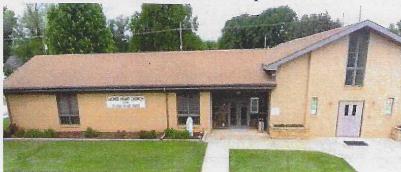
Sacred Heart in Anthony