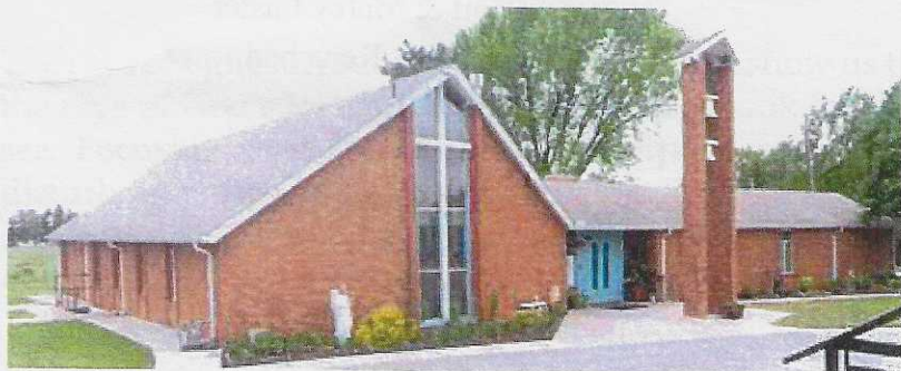
St. Patrick in Harper