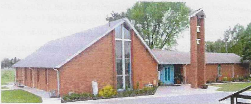
St. Patrick in Harper