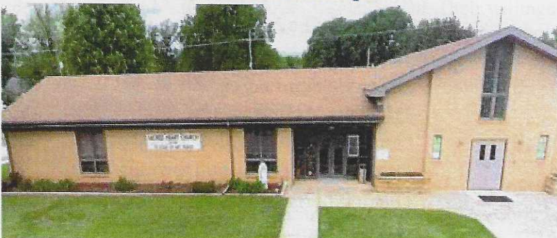
Sacred Heart in Anthony