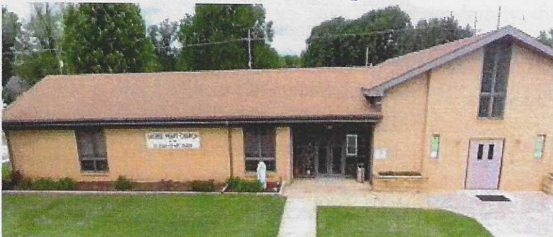
Sacred Heart in Anthony