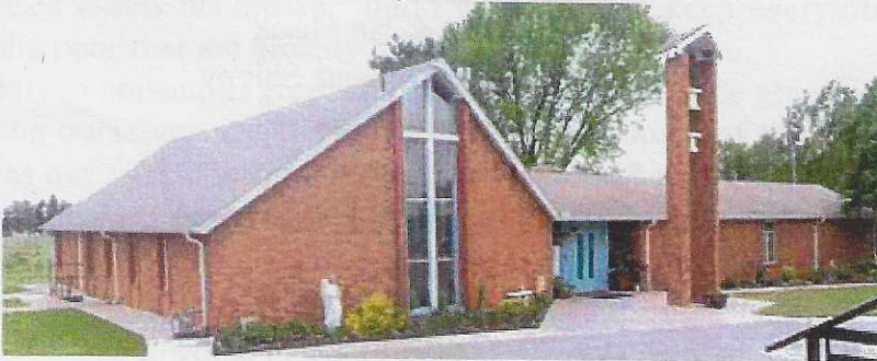
St. Patrick in Harper