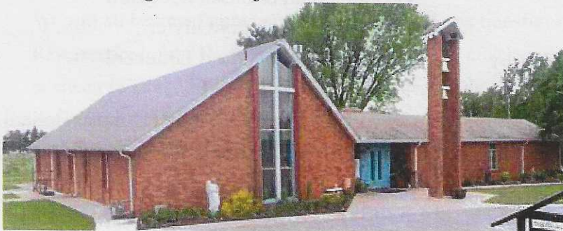
St. Patrick in Harper