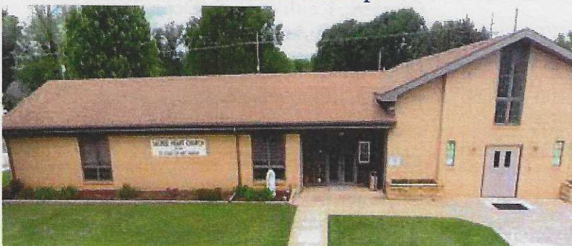
Sacred Heart in Anthony